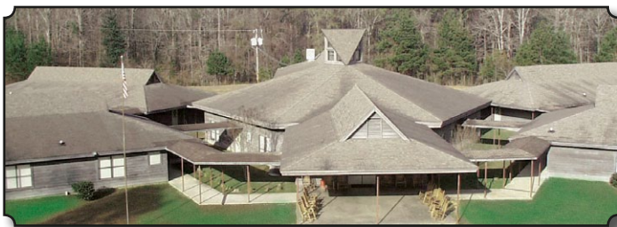
Durr-Wise Retreat Center - Camp Wesley Pines

The Registration Deadline is September 25, 2009